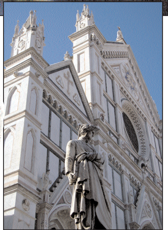
■ The facade of the Santa Croce, Robin's favourite Florentine church.